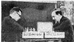
9. Leningrad, 1940. Botvinnik versus Ragozin